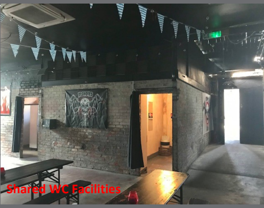
Shared WC Facilities