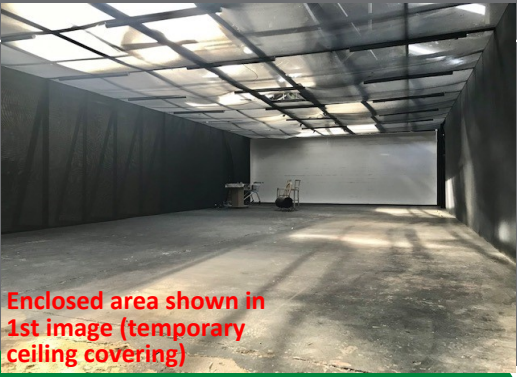
Enclosed area shown in 1st image (temporary ceiling covering)